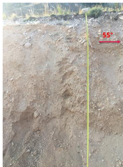
Fig. 6. The deposition section in Zunduk Рис. 6. Фрагмент осадочной толщи в районе Зундука