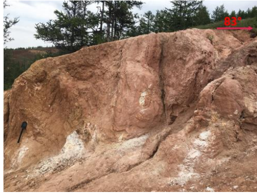
Fig. 7. The weathering crust in southwest of Khoboy Cape Рис. 7. Кора выветривания на юго-западной оконечности мыса Хобой