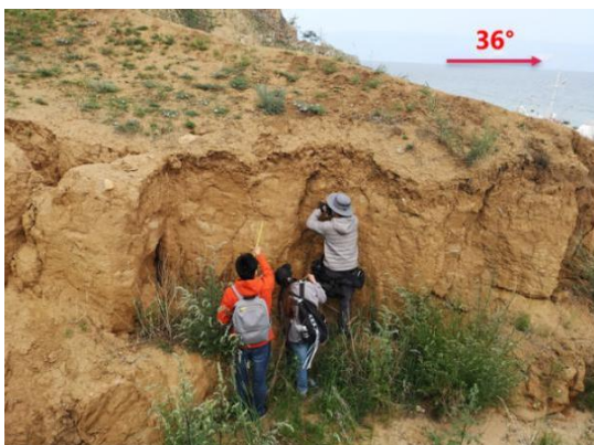
Fig. 5. The deposition section in Khuzhir Рис. 5. Фрагмент осадочной толщи в районе Хужира

The sampling section is a weathering crust which located at the northeast corner of Olkchon island and the southwest of Khoboy Cape (Fig. 7). The weathering crust indicates chemical weathering and relevant researches show that it was formed in 3.5–3 Ma. The clay in different colors can be seen in the small scale area which is caused by the change of the chemical composition of the original rock. We obtained 7 samples from the pink clay with a 10 cm interval between each other.