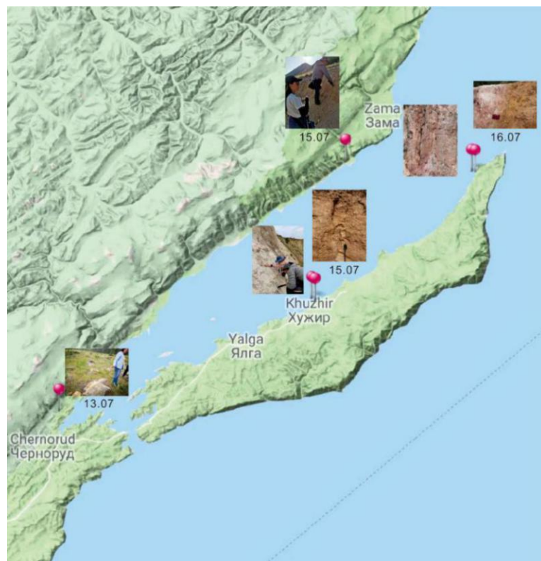
Fig. 2. Sampling points locations (label is the date of sampling)

The sampling site is at Khuzhir Village valley which is a crack generated by the uplift of Olkchon island. The water moves the unconsolidated sediments away to form a channel. Then the uplift continued and the water accumulated along the channel.