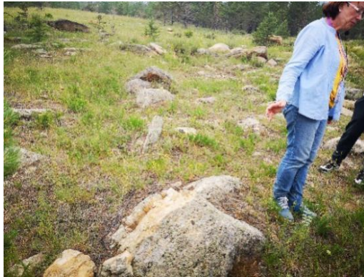
Fig. 3. SG1 sampling location Рис. 3. Расположение точки отбора SG1

The samples may contain characteristic information about the elements of lake water and some REE anomalies caused by the tectonic movement. The section was orange in color. We took samples from the top without plant roots at a 10 cm interval, with a total of 8 samples.